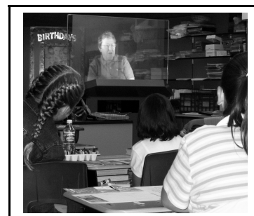
Figure 2. The Virtual Teacher

The Virtual Observer (VO) allowed the consultant to capture video of teachers from the experimental group as they implemented the instructional strategies they had previously learned (see Figure 3). The VO is a wheeled locker containing an auto-tracking camera. As the camera automatically followed the teachers around the classroom it recorded the teaching session onto a DVD.