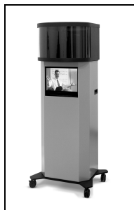
Figure 3. The Virtual Observer

Together, these instruments provide an assessment of the degree to which and the fidelity with which teachers in the experimental and comparison were implementing the remote consultant's instructional strategies. The final quantitative instrument was a mathematics test designed to evaluate students' mastery of the content presented by the consultant. Qualitative data were collected primarily via video recordings of telepresence interactions between the consultant and teachers and students in the experimental group.