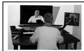
Figure 1. The Telepresence Center.

of a TC unit in northern Utah, teachers received corrective and directive feedback, suggestions, and instructional advice from the consultant as if they were in the same room sitting across a table from each other. Document cameras allowed those communicating to share paperwork or mathematical manipulatives.